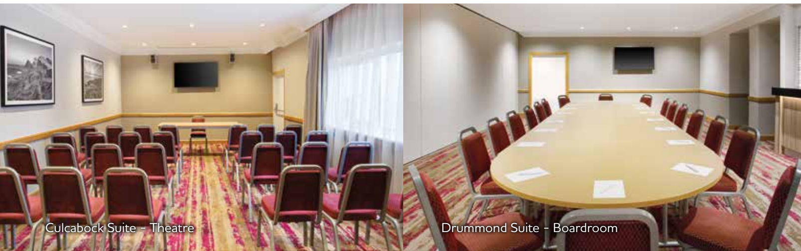
Culcabock Suite - Theatre

Featuring state of the art equipment as well as our dedicated team who are at your service, these rooms can be set up as U-shape, Cabaret, Boardroom, Classroom or Theatre style.