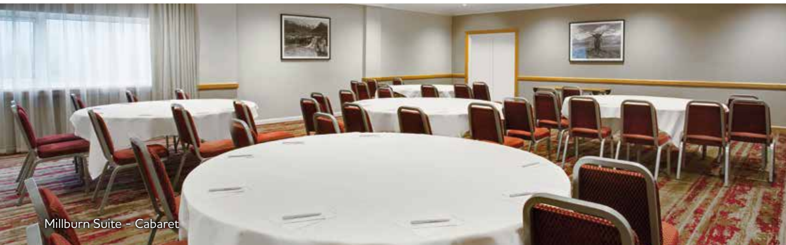
Millburn Suite - Cabaret

All of our small to large meeting rooms boast the same flexibility and technology as our training rooms and feature natural daylight in a modern surrounding.